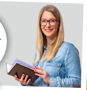
SOCIAL EDUCATION WORKER (BACHELOR OF ARTS)

BUSINESS MANAGEMENT EXPERT (BACHELOR OF ARTS)